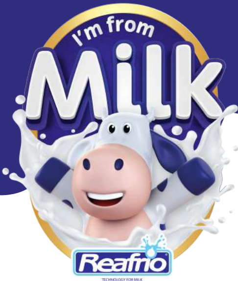
Reafrio 700 to 1200 Liters Vacuum Unit